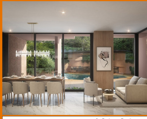
2 - Bedroom Penthouse